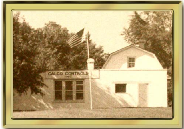
Since the early days, CalCo has always stood for excellence. Today they incorporate that distinction into many innovative areas.

display pedestals, working models, skills training programs, custom cases, containers and much, much more. In fact, CalCo's tremendous attention to detail and quality as well as their strict timetable is about all that hasn't changed since 1953. CalCo's excellent reputation