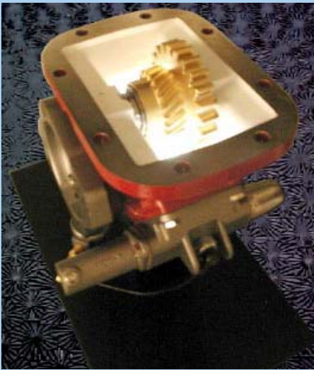
Passageway lighting is the next big facet to turn heads at trade shows and exhibits.