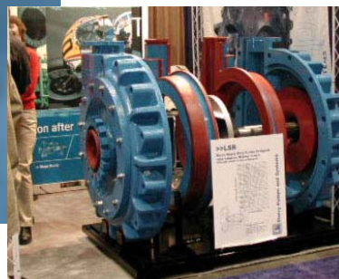
An exploded view is another fascinating way to show the inner workings of a product, and that was exactly what GIW had in mind.

design were involved to properly suspend the massive pieces in midair, allowing viewers to practically crawl inside of the giant pump and take a look around.