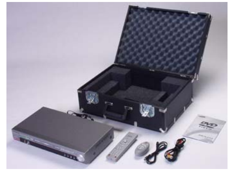
It makes sense to leave the details to CalCo, especially because the results will turn out as well as every other project they accept.

CalCo has been working with training program designers for some time now, and when International Truck and Engine called upon CalCo to help coordinate the roll-out of their new DVD based training program, CalCo cheerfully obliged. This included the purchasing, photography, packaging, distribution and follow-up of the entire roll-out. CalCo is constantly proving their commitment to the client by stepping up when needed and providing the same level of quality found in every project they work on. ©