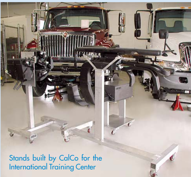
Stands built by CalCo for the International Training Center