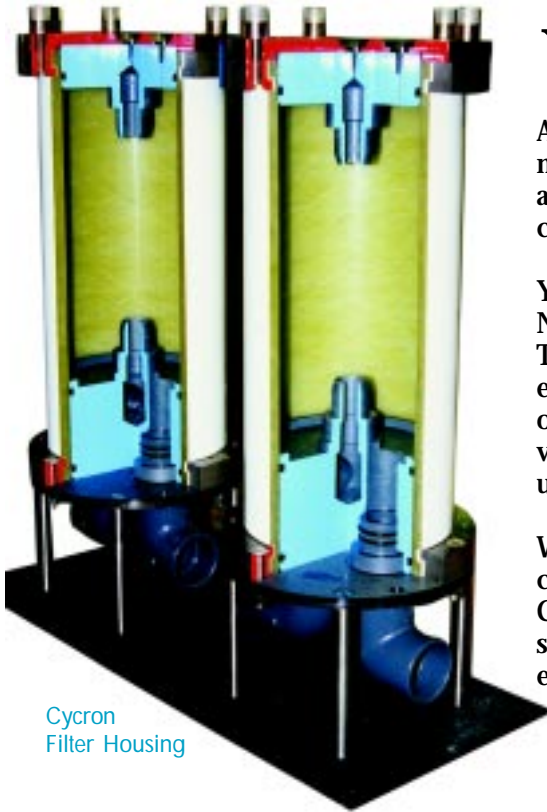
Cycin Filter Housing